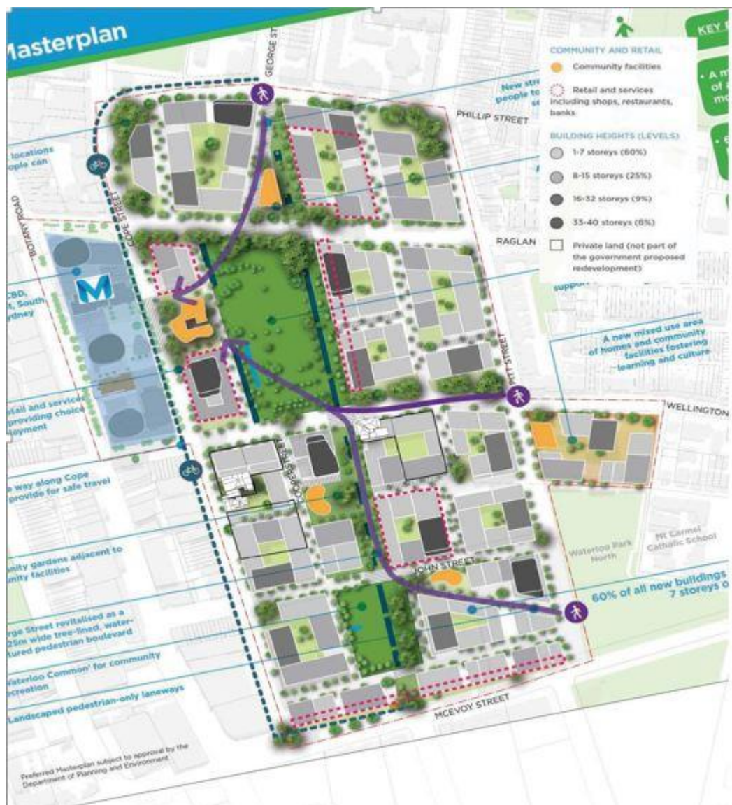
The NSW Government scheme has a variety of building heights and a series of parks that flow through the site

"What is needed by the City of Sydney Council is positive comments about how to improve the public domain and social outcomes of the masterplan rather than the current approach to totally undermine the proposal. The end result of the Lord Mayor's attack could be to stop the project and put it on hold for a few more decades. We are on the edge of making the revitalisation of Waterloo a reality after years of detailed work with the community. To sabotage all this work now would be a very destructive act by the City of Sydney Council."