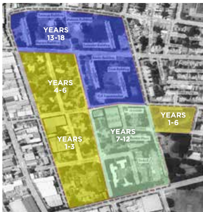
1. Indicative and subject to preferred plan finalisation.

The diagram below outlines the stages of the Masterplanning consultation program. We are now at the preferred plan stage.