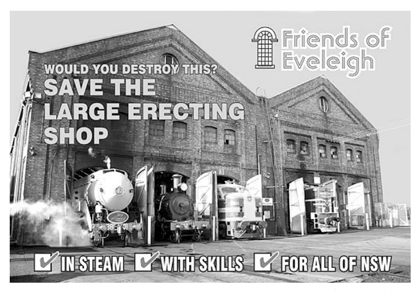
A poster to mobilize support—showing the grandeur of the building.

nett effect of this has been to deliver much of government planning into the hands of the biggest single bidders, the mega-developers. It is interesting that even Friedrich Hayek, doyen of the neo-liberals, had doubts about the privatisation of town planning<sup>6</sup>, suggesting that it might be prone to chronic market failure and institutionalised corruption.