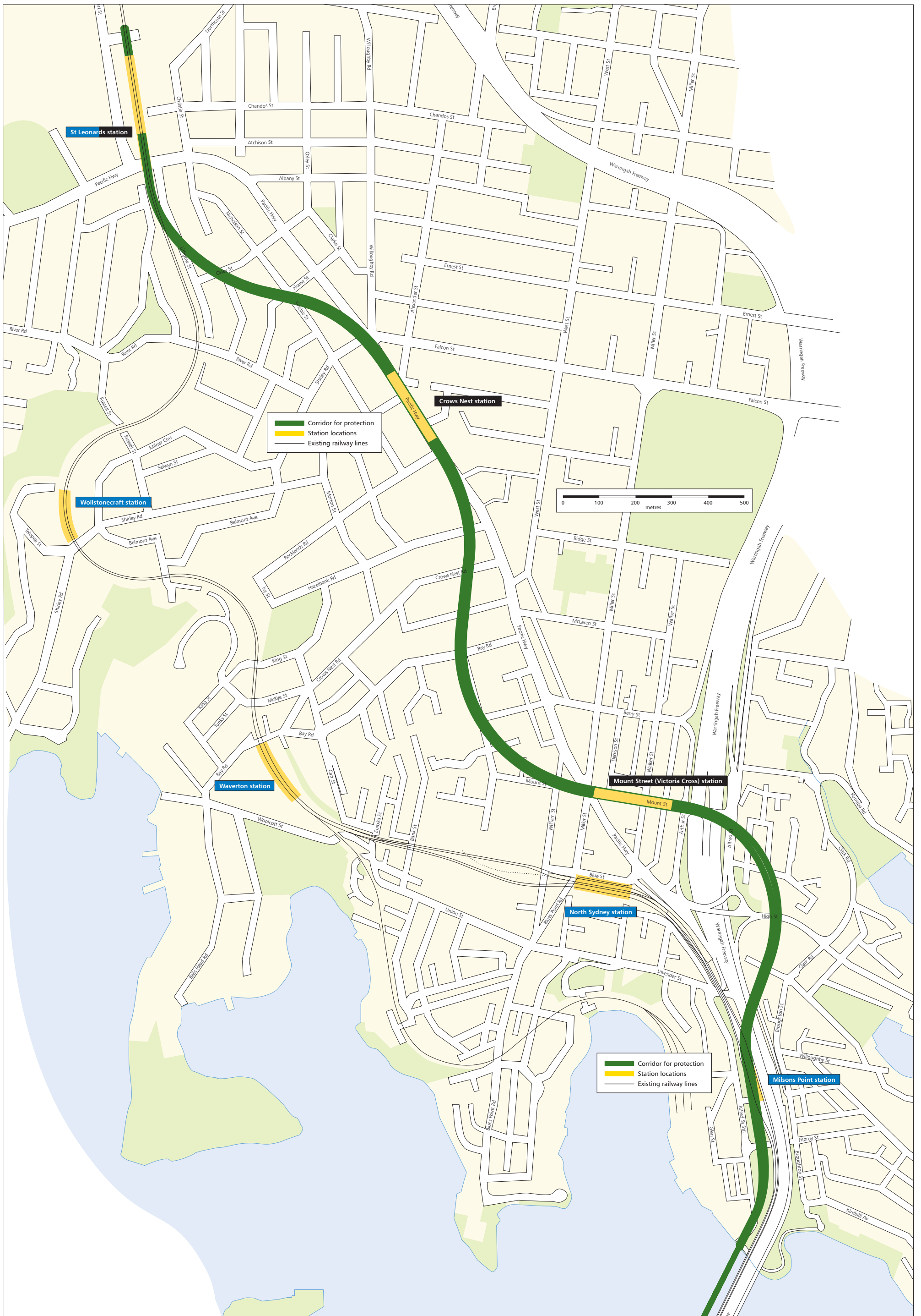
Metropolitan Rail Expansion Program: Metro Pitt and Metro West indicative protection corridors, October 2005 (map 1 of 3).