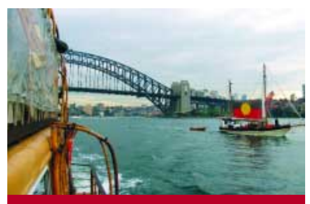
The "Tribal Warrior" sailing Sydney Harbour during NAIDOC Week, taken from the deck of the "Deerubbun".

finalise the camp details and to scope out the ongoing program which will include similar camps for girls.