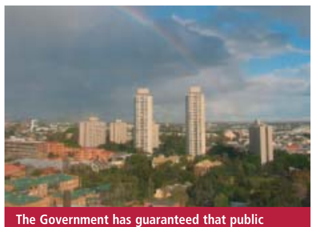
housing tenancies are secure.