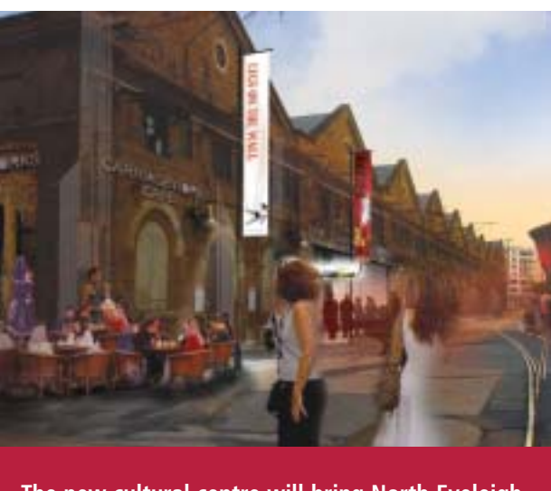
The new cultural centre will bring North Eveleigh to life for the local community.

The Contemporary Performing Arts Centre is scheduled to open in January 2007, in conjunction with the Sydney Festival.