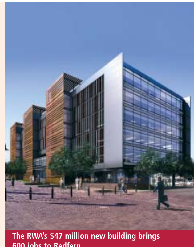
600 jobs to Redfern.

Construction will be in accordance with the RWA's Jobs Compact, employing local Indigenous people and new apprentices as a key element.