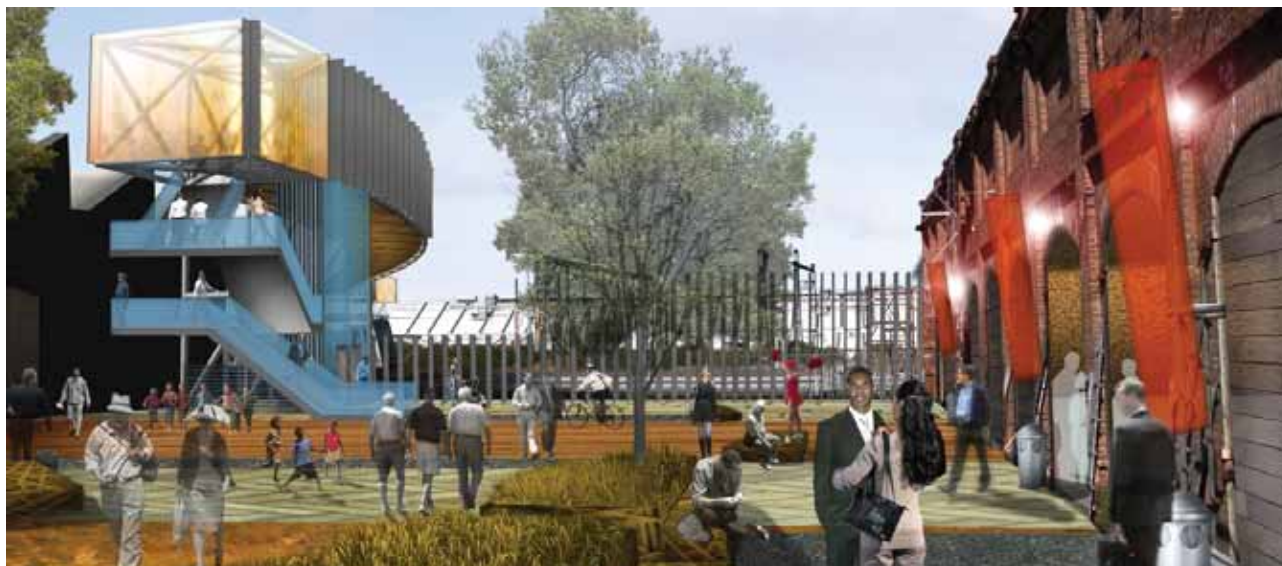
Artist's impression of pedestrian and cycle bridge in North Eveleigh.

The Built Environment Plan also proposes a second potential pedestrian cycle bridge just to the west of Redfern Station. This proposal is currently being considered by the RWA and RailCorp as part of the joint concept design study for the redevelopment of Redfern Station.