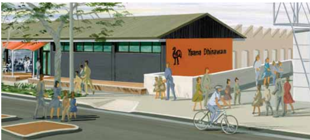
Artist's impression of the proposed indigenous catering (Yaama Dhinawan) and construction training facility.