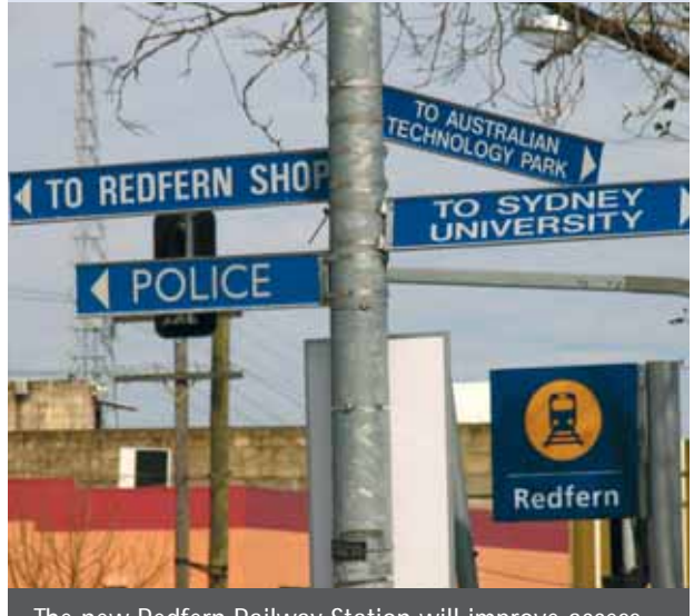
The new Redfern Railway Station will improve access, safety and passenger service.

Improved safety, access and capacity to meet expected future passenger demand are a vital part of the joint RailCorp/RWA project.