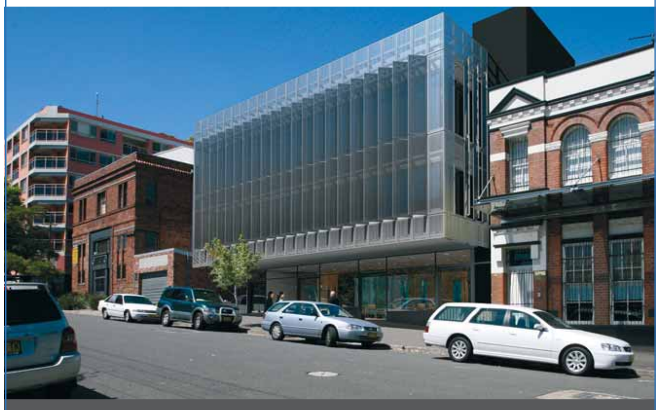
Artist's impression of the $8 million development at the old Black Theatre Site.

The Indigenous Land Corporation (ILC) is about to step into the local limelight yet again, with the proposed $8 million redevelopment of the historic Black Theatre Site at Redfern. This follows on from the ILC's $35 million investment in redeveloping the former Redfern Public School site. The ILC hopes to start construction at the old Black Theatre site by mid 2007 with completion by March 2008.