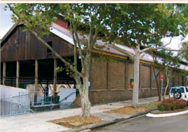
The Blacksmiths Workshop: the current site where the new community markets are proposed.