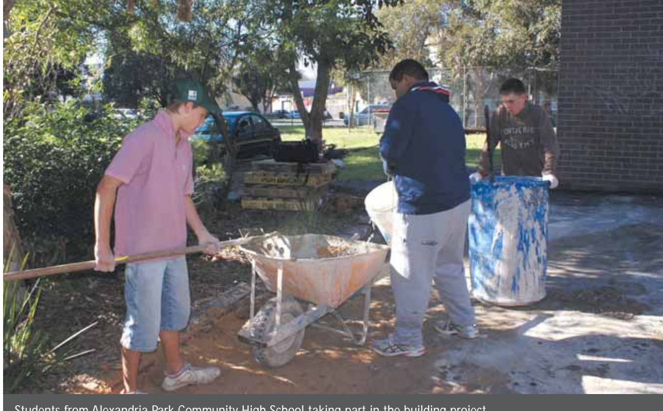
Students from Alexandria Park Community High School taking part in the building project.

Valuable support was provided by the Brick Industry Training School and the Local Community Partnership who supplied a young bricklayer to help the students for two weeks as well as provide material. Bunnings Warehouse also contributed to the program by donating several bags of cement to the school for the program.