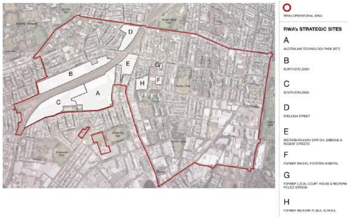
Figure 2 RWA's Operational Area and RWA's Strategic Sites

The BEP Stage One considered comments and ideas provided by residents, land owners, business operators, peak organisations and government agencies in its preparation. It also drew on earlier work and community consultation undertaken by the former Redfern-Waterloo Partnership Project and the former Department of Infrastructure, Planning and Natural Resources as part of the Redfern, Eveleigh, Darlington and Waterloo (RED) Strategy in 2003.