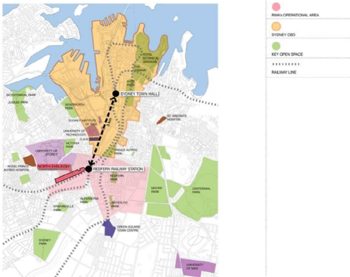
Figure 1 Location of North Eveleigh Site

North Eveleigh is a 10.7 hectare site located within 3kms of the Sydney CBD and 100 metres from Redfern Railway Station, the University of Sydney and the Australian Technology Park. It is surplus to the requirements of Railcorp and has been largely disused for the past 20 years. Figure 1 shows the location of the North Eveleigh site.