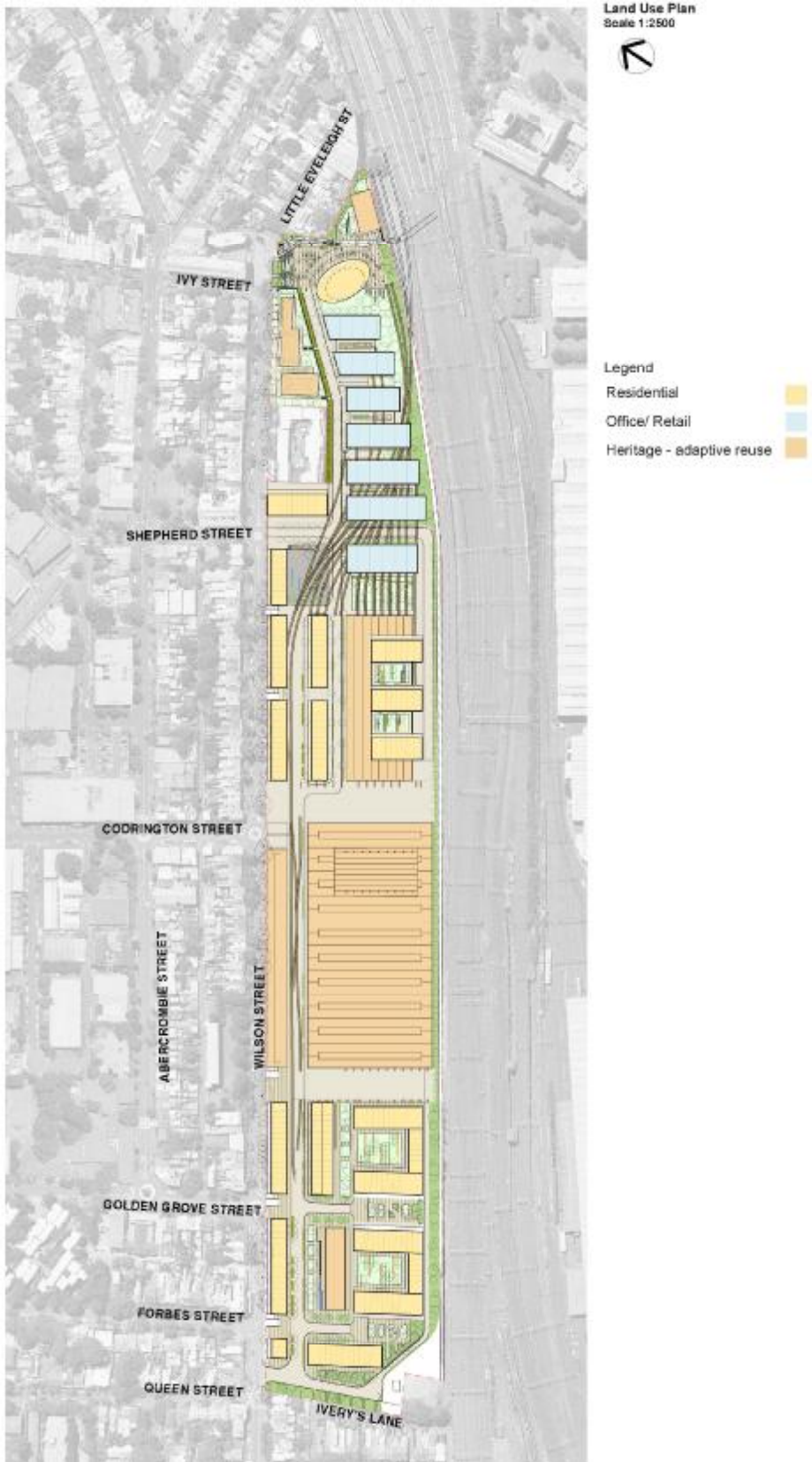
Figure 3 North Eveleigh Concept Plan