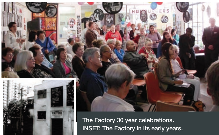
The Factory 30 year celebrations. INSET: The Factory in its early years.

The Factory auspices the Redfern/ Waterloo Housing NSW Communities Program which employs a