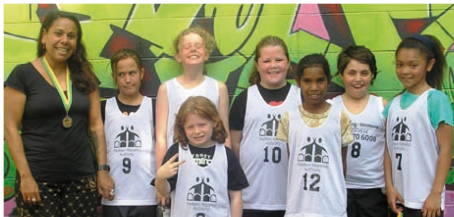
The All Blacks Under 12's finished as runners up – a great effort.