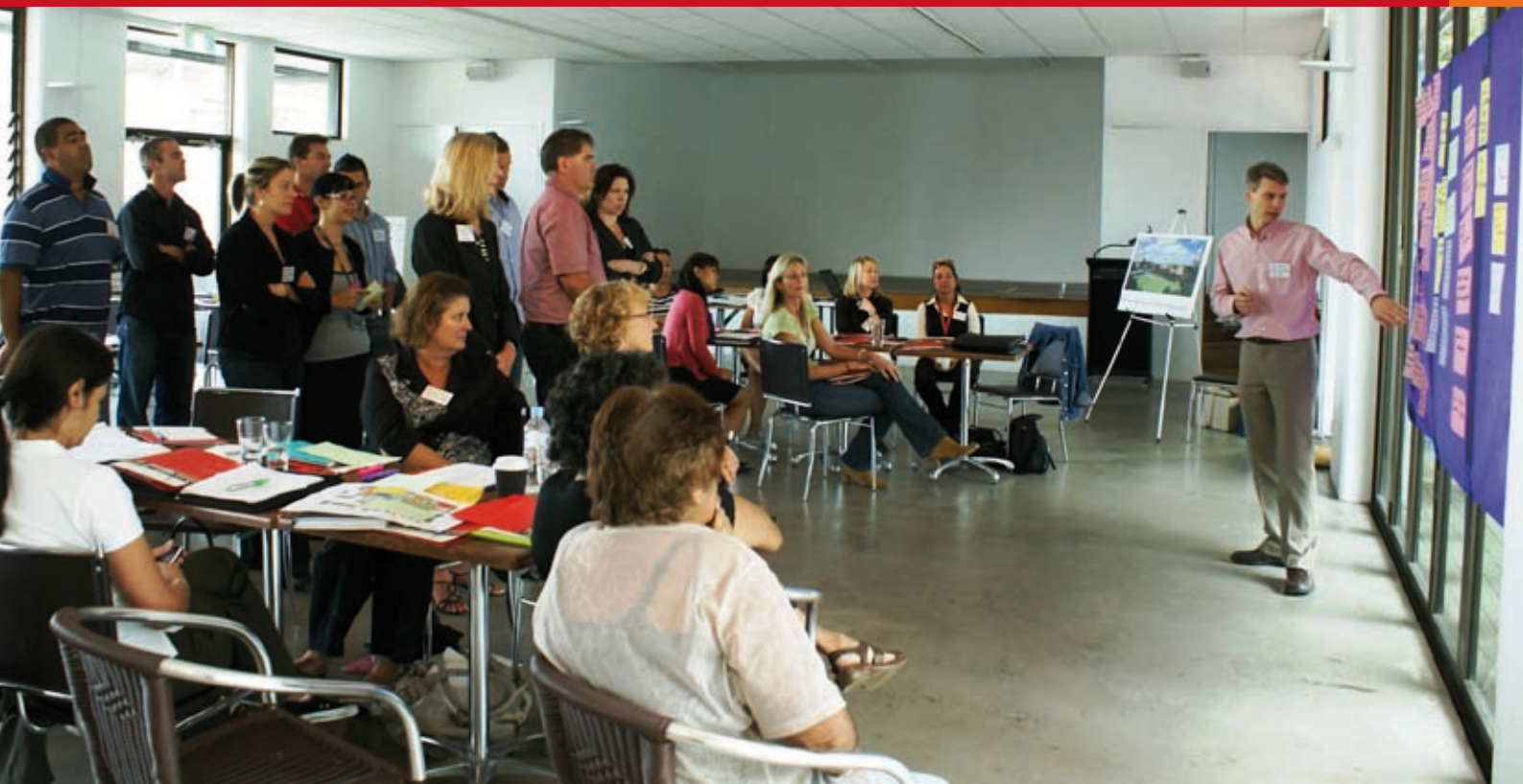
Workshop participants planning the new sporting and recreation facilities in George Street, Redfern.