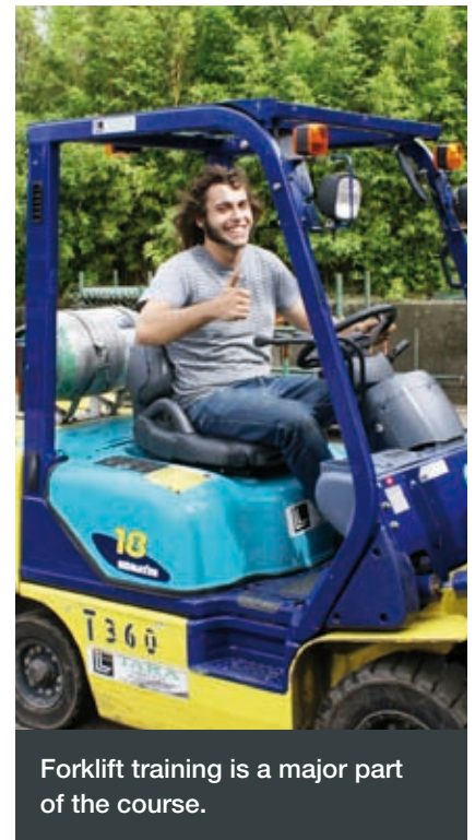
Forklift training is a major part of the course.