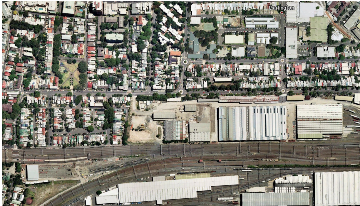
Figure 1 Google Earth Image 2010