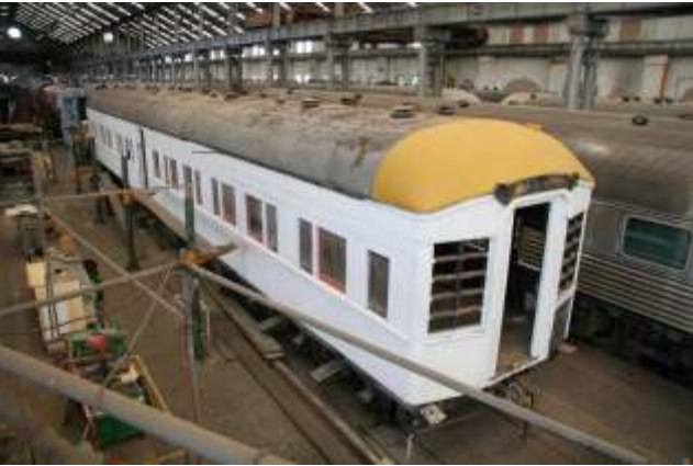
Completely new side and end panels fitted

It is not only carriages that are being maintained and restored in the Large. Continual maintenance is also being carried out on the diesel locomotives to keep them in top safe operational condition.