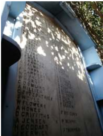
The World War I Memorial