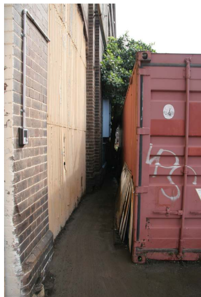
The blue Memorial behind the container