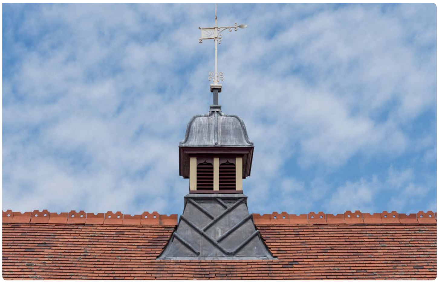
Redfern Station owes its unique character to its historical buildings.