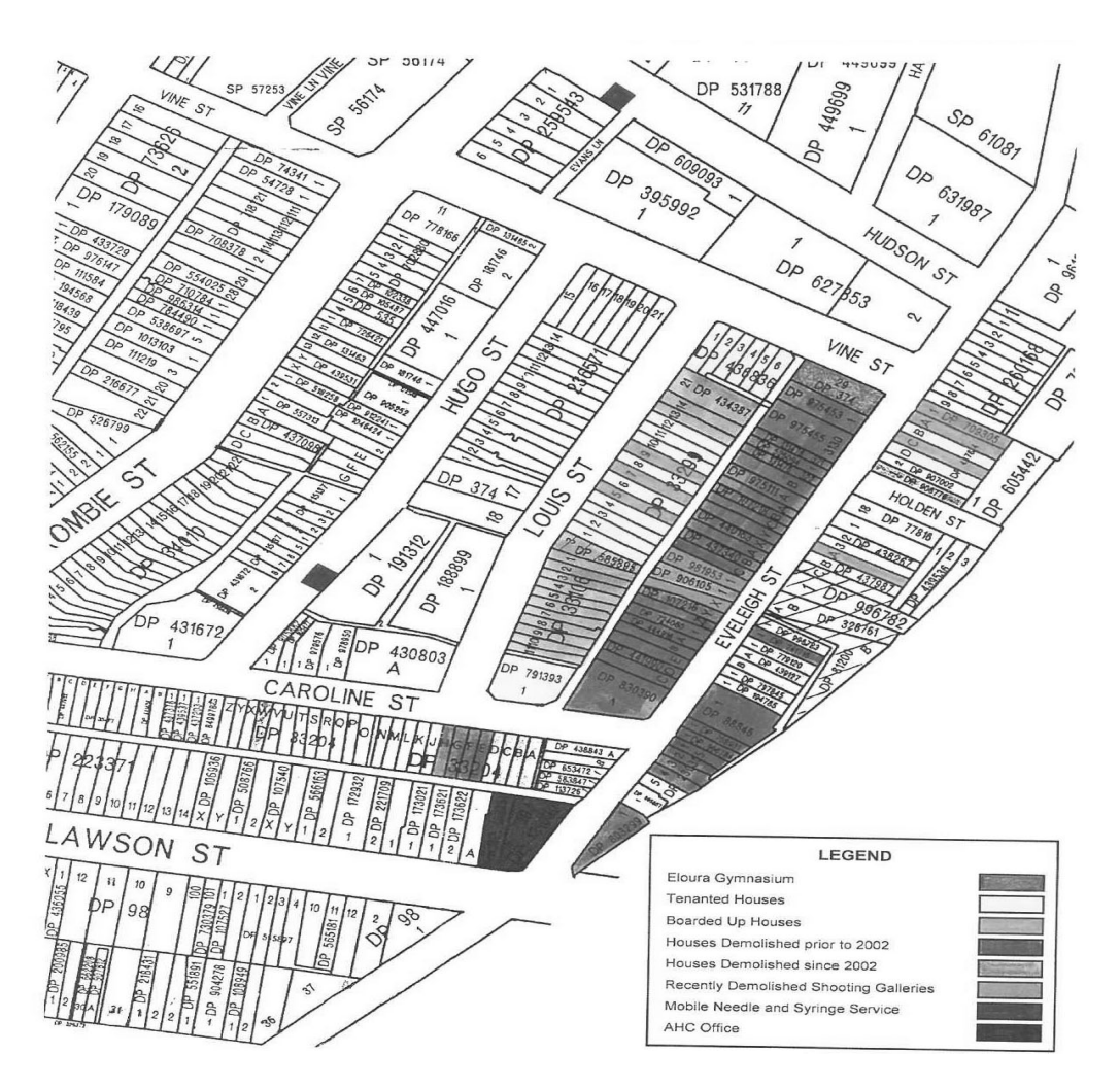
Figure 5.1 Locations of mobile needle and syringe van and demolished houses